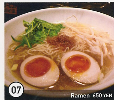
07 Ramen 650 YEN