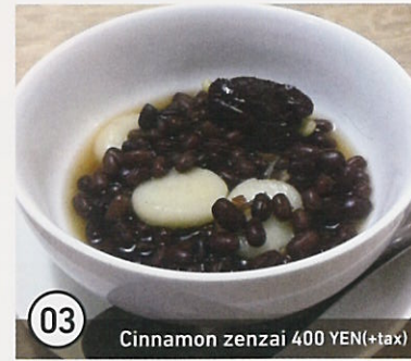
03 Cinnamon zenzai 400 YEN(+tax)