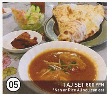
05 TAJ SET 800 YEN *Nan or Rice All you can eat