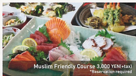
11 Muslim Friendly Course 3,000 YEN(+tax) *Reservation required