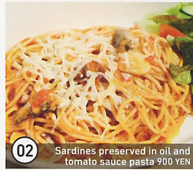
02 Sardines preserved in oil and tomato sauce pasta 900 YEN