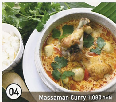
04 Massaman Curry 1,080 YEN