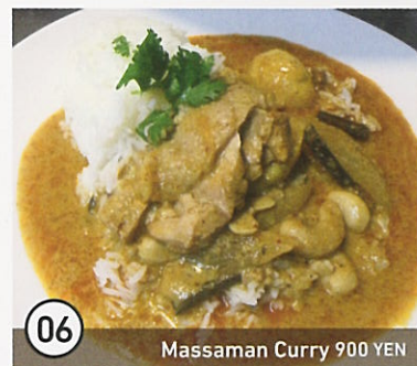
06 Massaman Curry 900 YEN