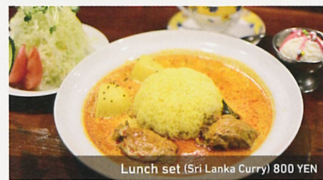
14 Lunch set (Sri Lanka Curry) 800 YEN

1F 1-5-22, Shimotori, Chuo-ku, Kumamoto-shi TEL: 0120-159-235(Toll Free)