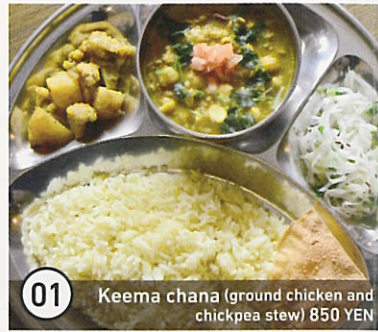
01 Keema chana (ground chicken and chickpea stew) 850 YEN